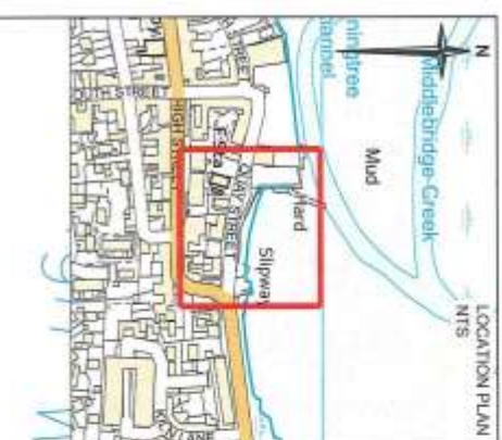
LOCATION PLAN NTS SITE PLAN SCALE 1:250